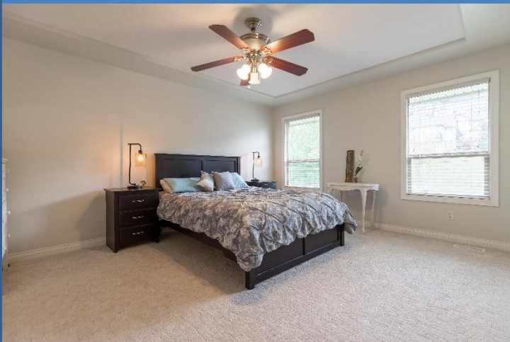
• Master Bedroom/Bathroom