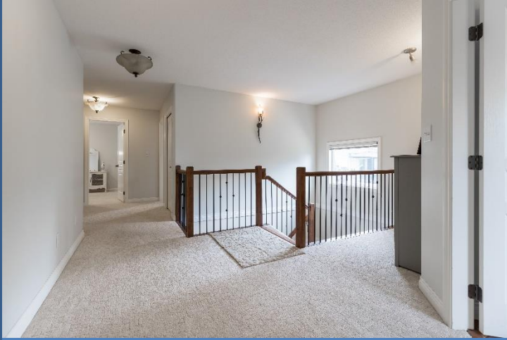
• Upstairs Landing