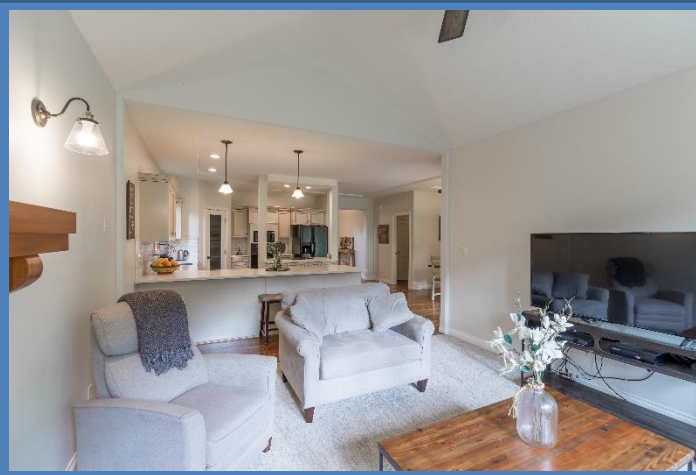
• Open Concept