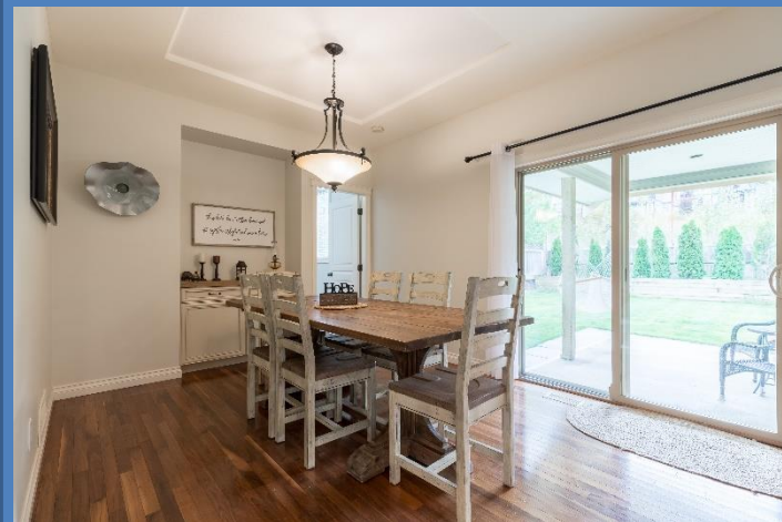
• Dining Room/Eating Area