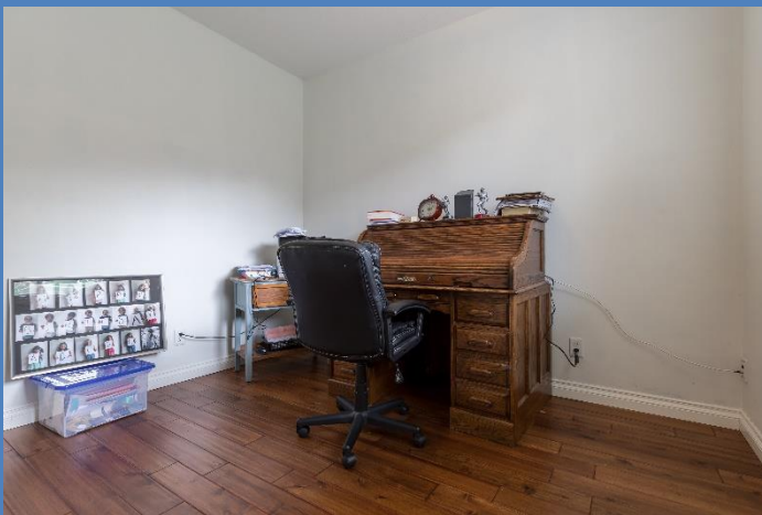
• Main Floor Bedroom