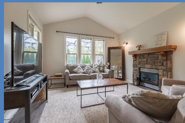
• Living Room