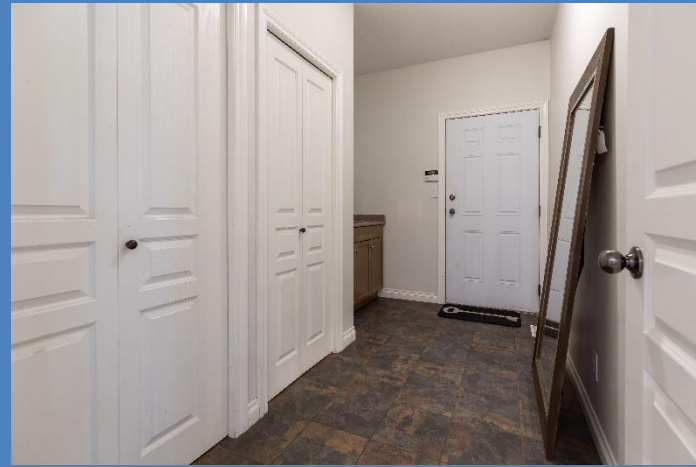
• Mud Room