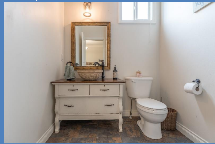
• Main Floor Powder Room