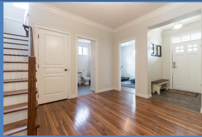
• Entryway and foyer